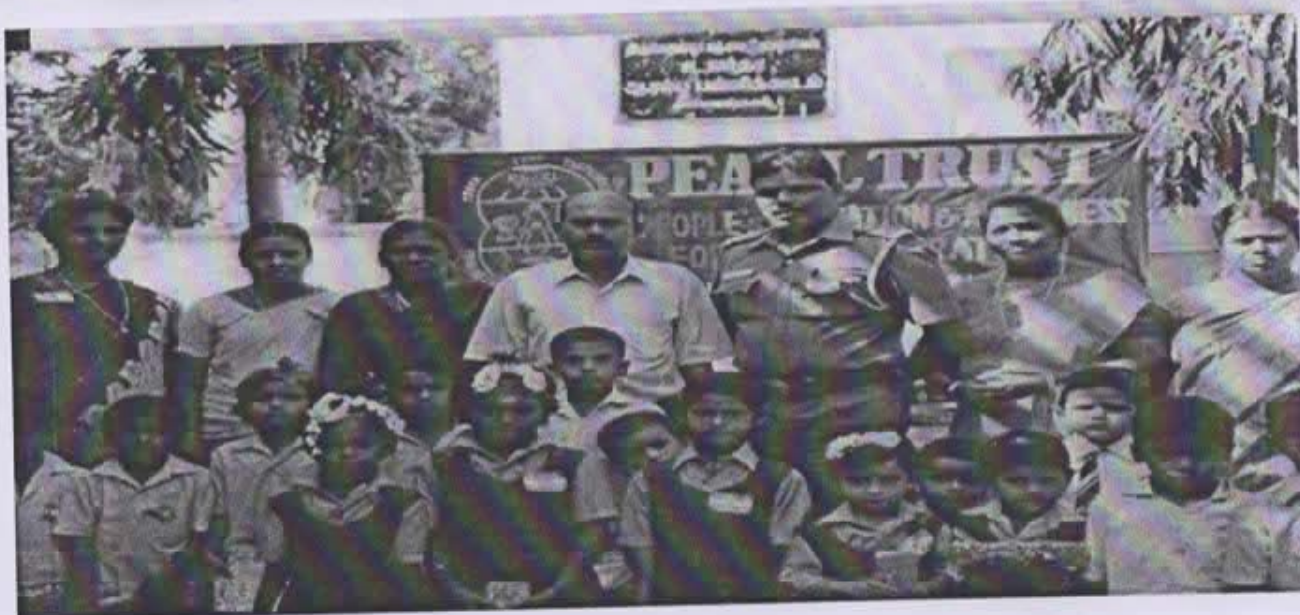
UNIFORMS, GIFTS DISTRIBUTION FOR SCHOOL CHILDREN