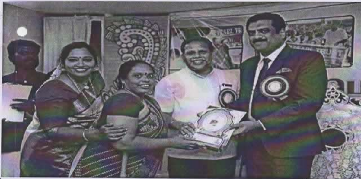
WORKSHOP FOR PHYSICALLY CHALLENGED