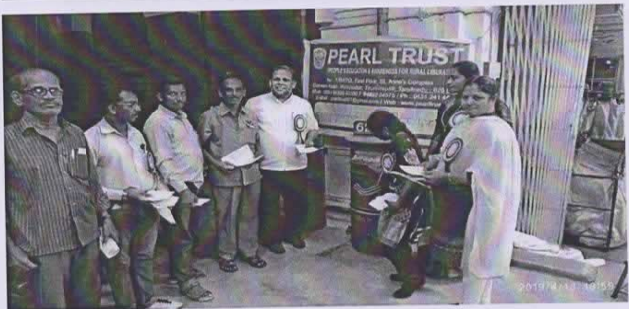
SEMINARS, SIGNATURE CAMPAIGN & LETTERS TO FRIENDS PROGRAMMES