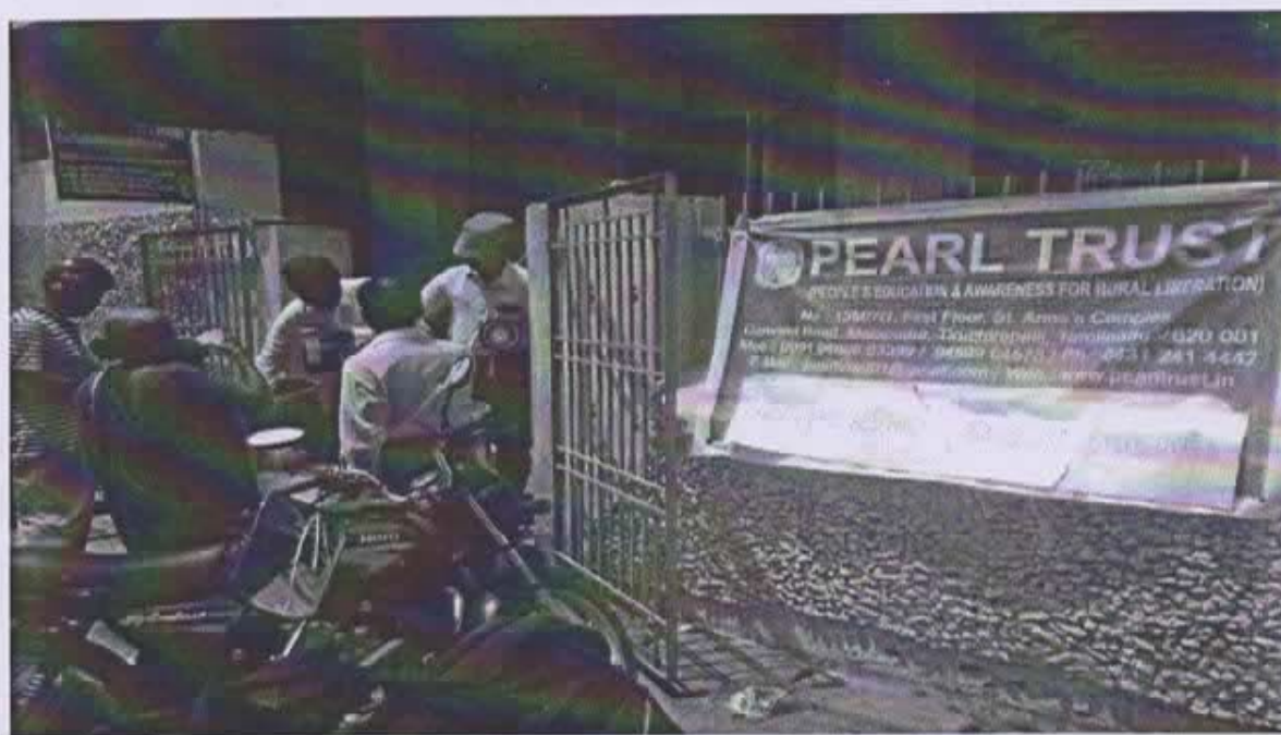
BUTTER MILK DISTRIBUTION