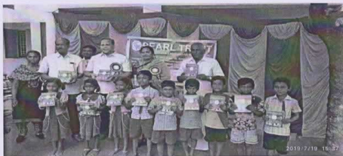
FREE NOTE BOOK DISTRIBUTION