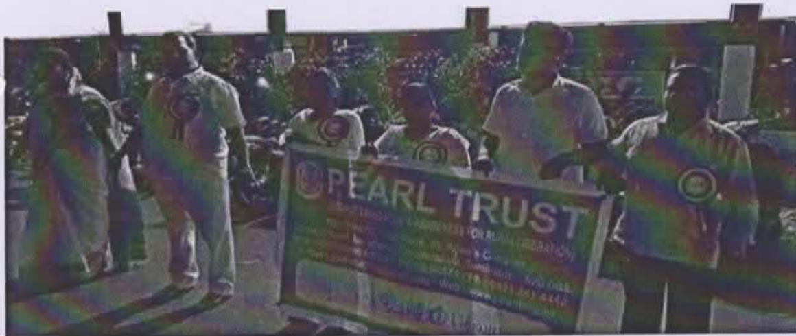
HUMAN CHAIN PROGRAMME